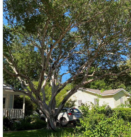
Native Texas Persimmon fruit (left) & 500-year-old Texas/Mexican Tree which bears a small black fruit, Barton Hills Neighborhood in Austin.