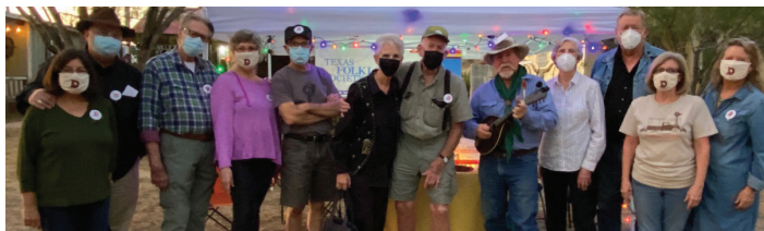
Some the TFS member fans in attendance

Embers glowing, Chili con Carne bubbling, and the words of J. Frank Dobie filling the air make a unique literary event celebrating folklore, literature, and storytelling of Texas and the Southwest. Dobie Dichos has been recognized by The New York Times as being one of “the” events to attend in Texas. Imagine a rustic stage in the bed of a 1942 International Truck surrounded by—and beneath a canopy of—mesquite trees and a Texas sky. Authors and storytellers influenced by J. Frank Dobie are invited each year to participate in the event. They read/tell a story from one of Dobie’s works or read/tell a piece inspired by his works.