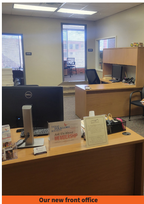
Our new front office

Also, having mail services on campus has allowed us to have a street address which gives Google a more accurate way to pinpoint our location. We still anticipate collaboration with organizations and events in Granbury, so watch for updates.