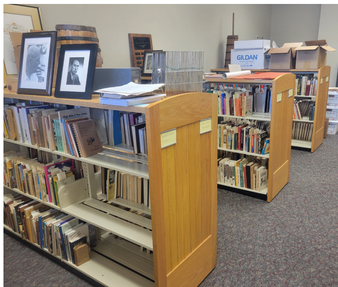
The TFS Library holds over 1000 books.